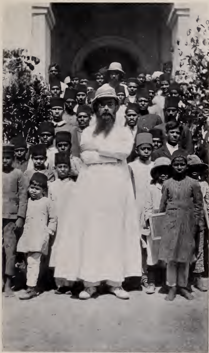
At an Italian mission school in Hyderabad